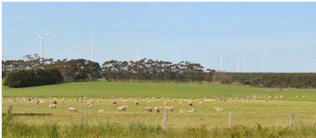
Photomontage of the proposed Willatook Wind Farm, from the Hamilton-Port Fairy Road, north of Orford.

An Environment Effects Statement Referral (EES Referral), based on the current proposed 83 wind turbine layout, has been lodged with the Minister for Planning. This will establish the need for an Environment Effects Statement. Further information on this process is provided below.